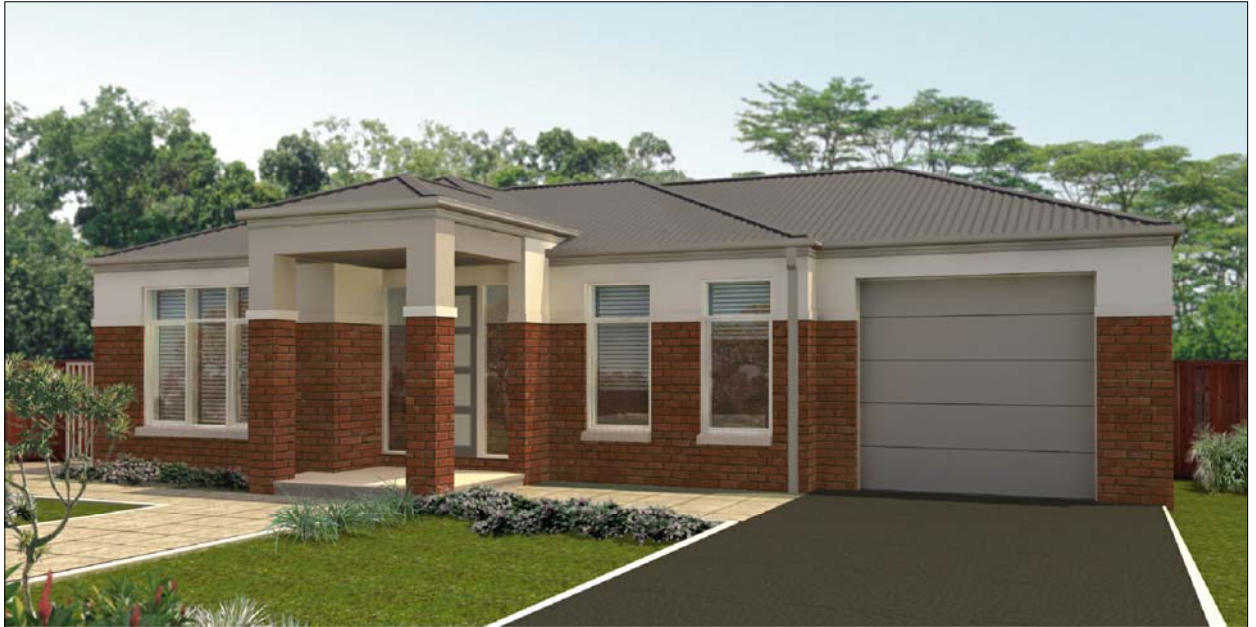
TRADITIONAL (T3) FACADE: colourbond roof